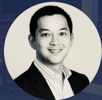
Chue Li Property Consultant

Viewings are strictly by appointment only.