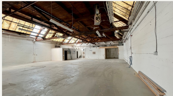
⬆ Warehouse Area