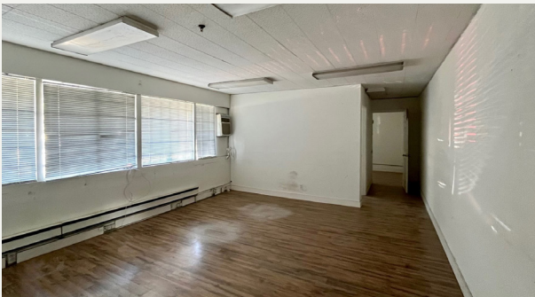
⬆ Front Office Space