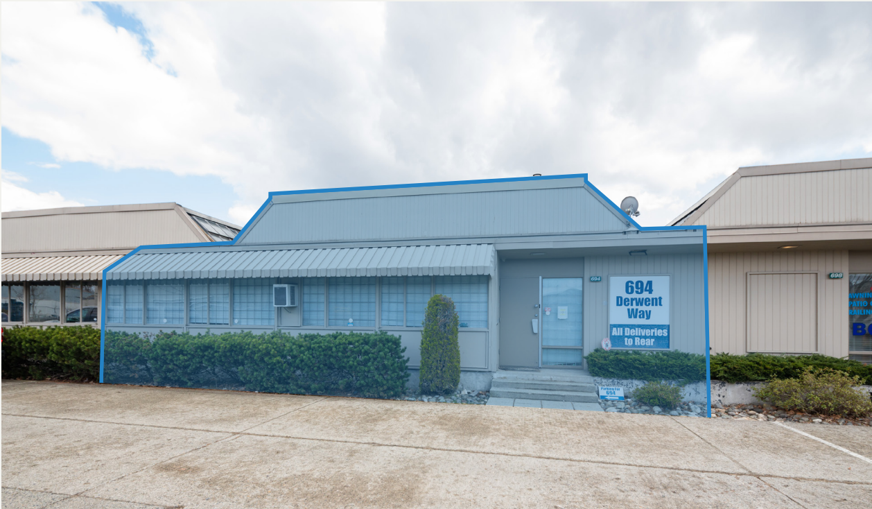
⬆ Front Entrance