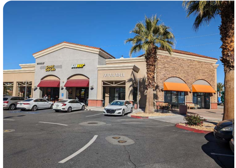
Suite F2 - 1,480 SF Total