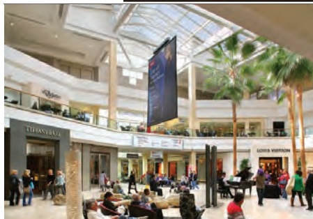
1 Westfield Topanga