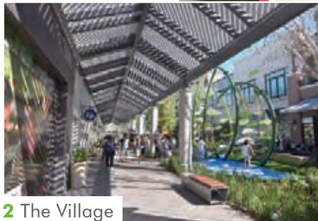
2 The Village