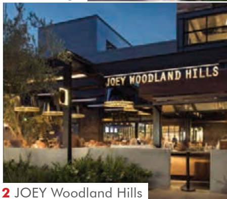
2 JOEY Woodland Hills