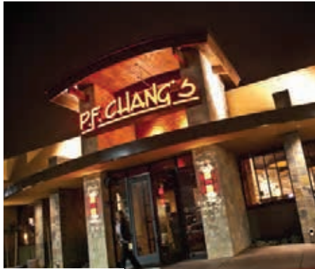
3 P.F. Chang's