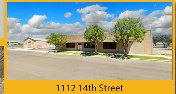
1112 14th Street