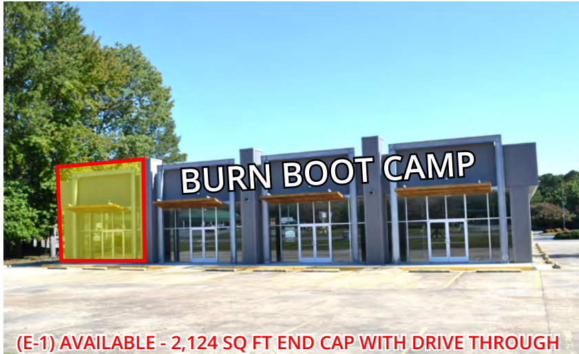
(E-1) AVAILABLE - 2,124 SQ FT END CAP WITH DRIVE THROUGH