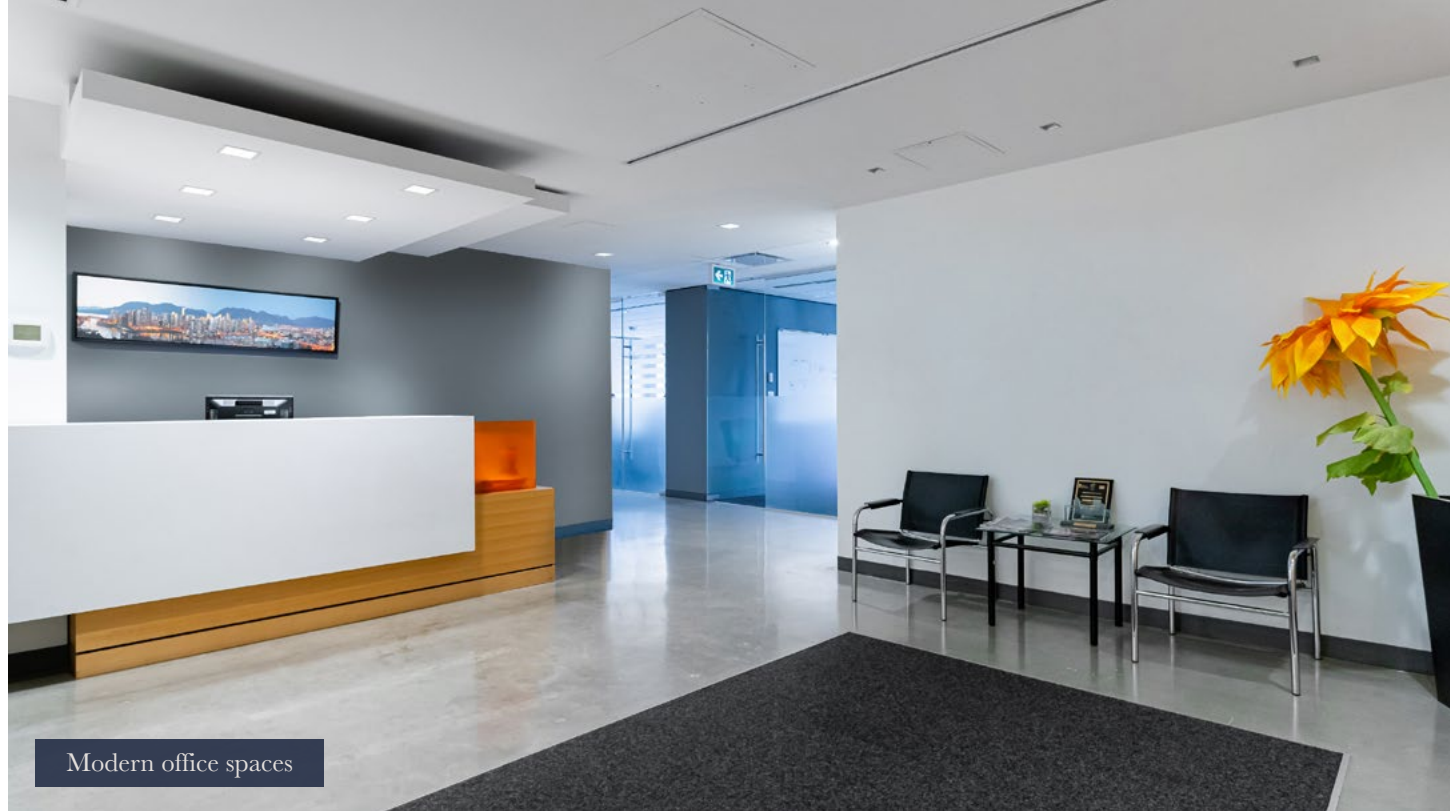
Modern office spaces