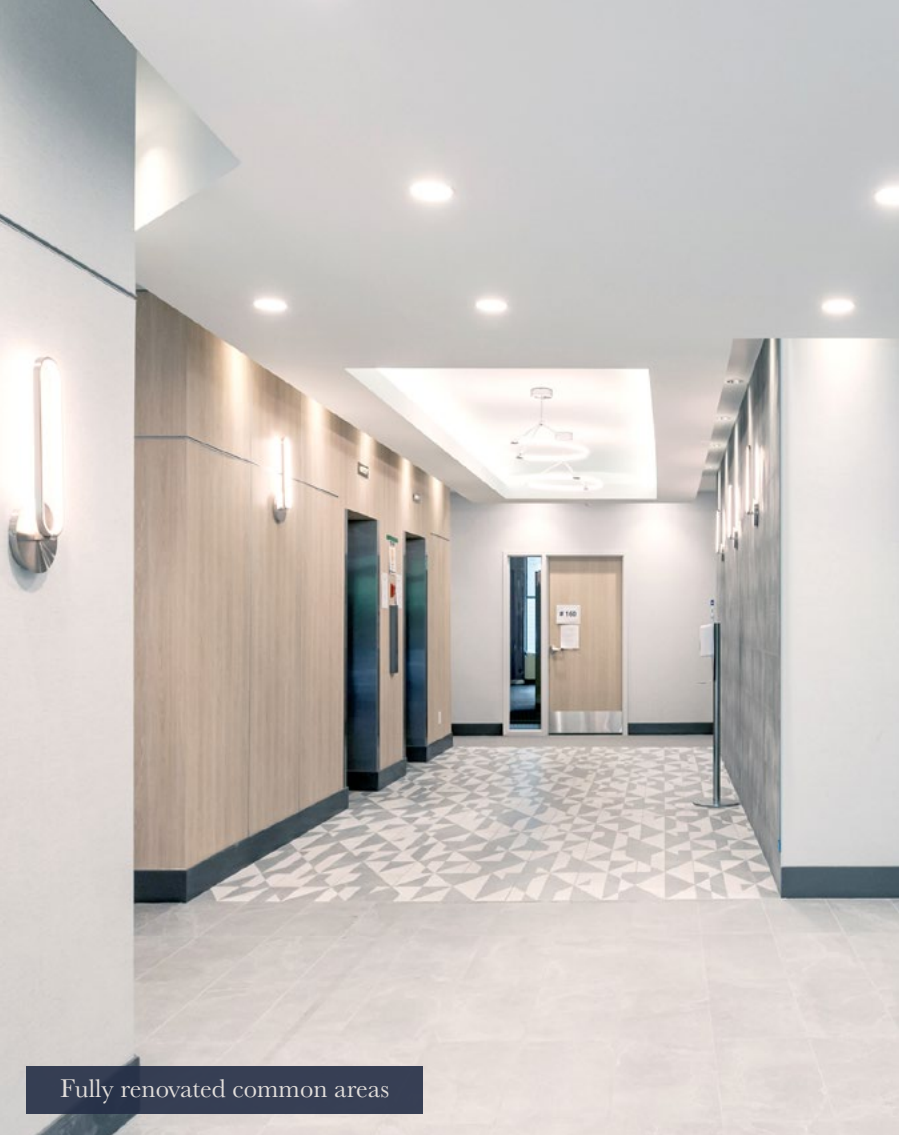
Fully renovated common areas