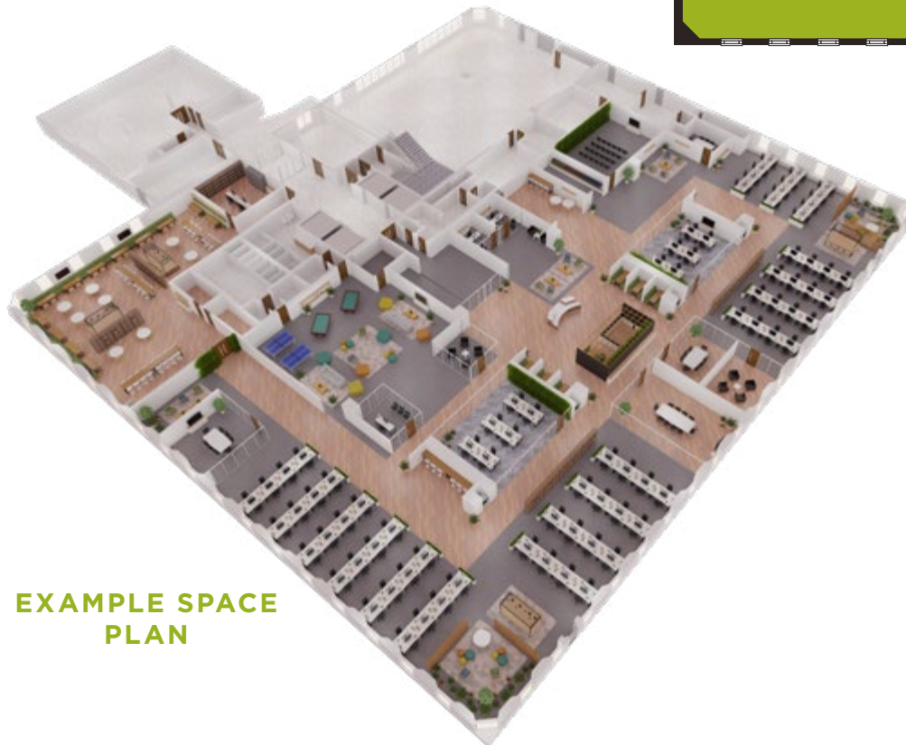
EXAMPLE SPACE PLAN