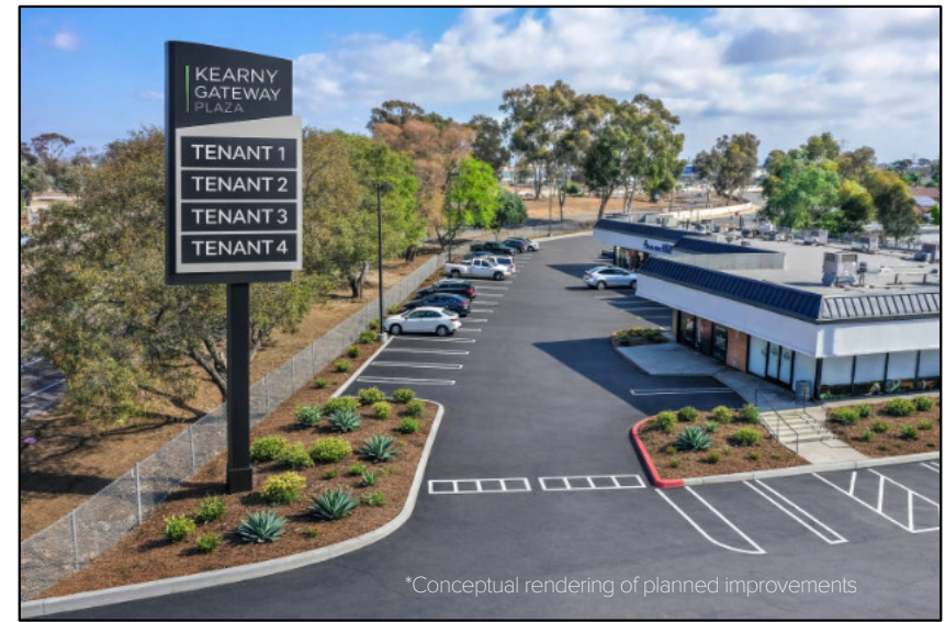
*Conceptual rendering of planned improvements