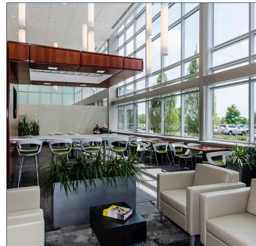
WIFI seating area - HillCrest II