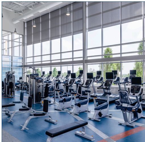
Fitness center - HillCrest II