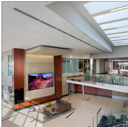
Lobby - HillCrest II