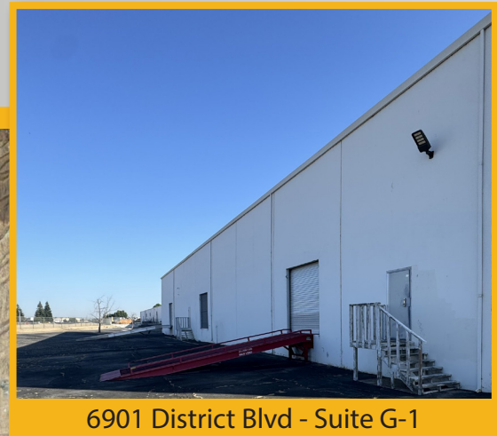
6901 District Blvd - Suite G-1