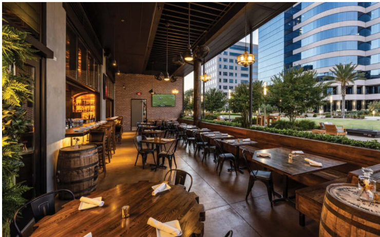
BOSSCAT KITCHEN + LIBATIONS