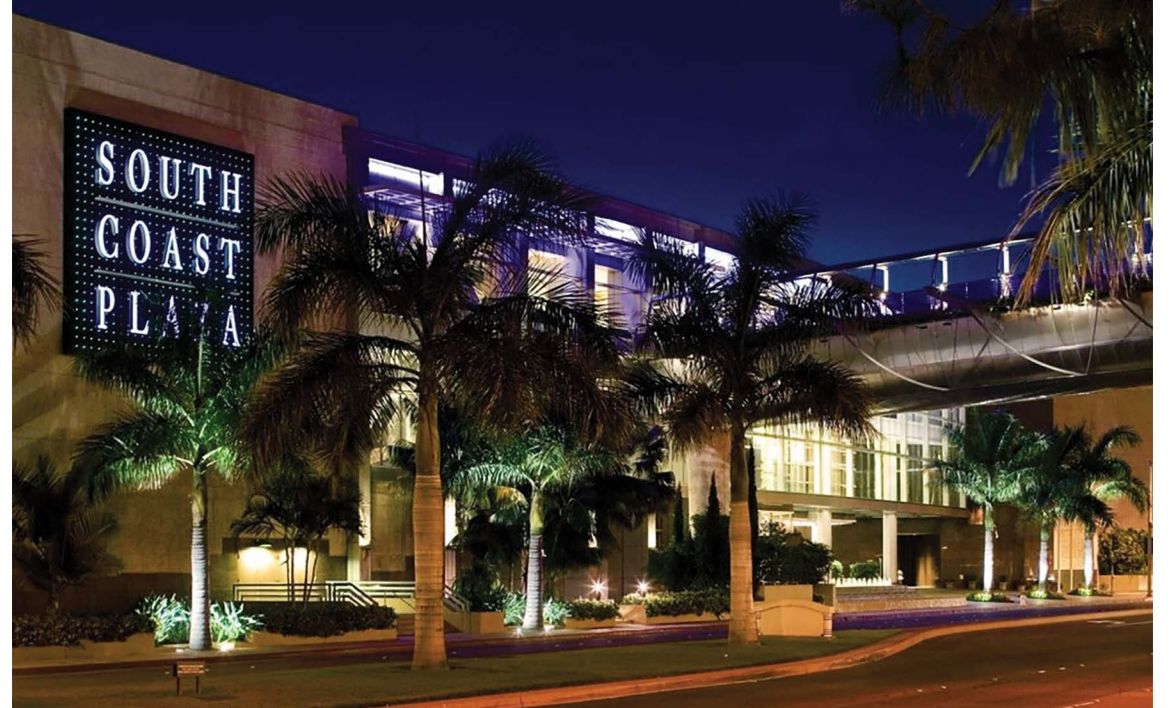
SOUTH COAST PLAZA