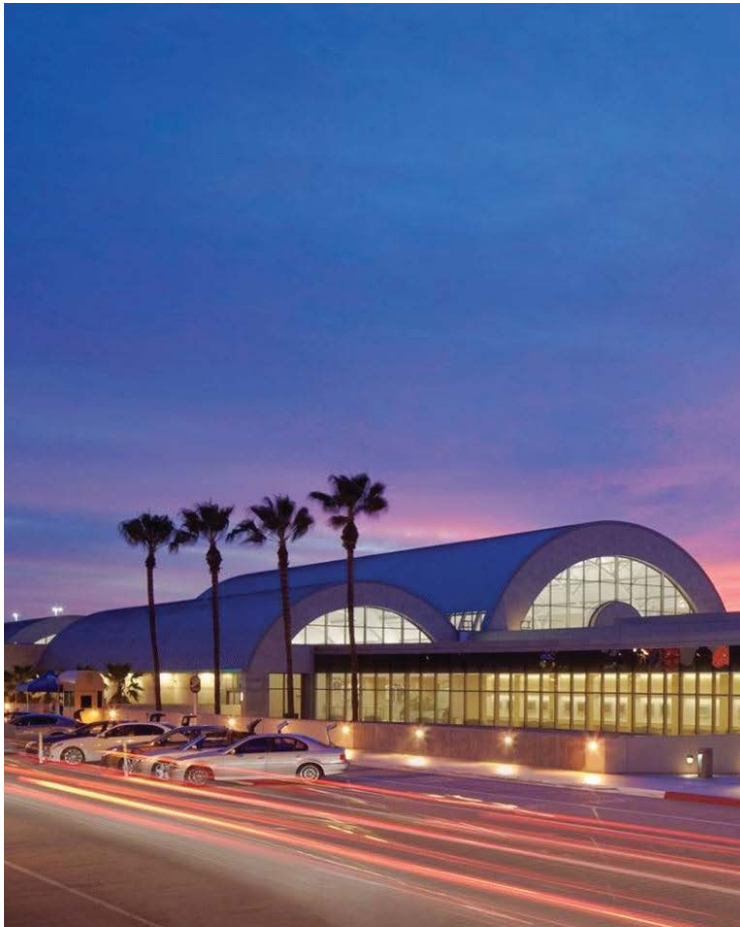
JOHN WAYNE AIRPORT