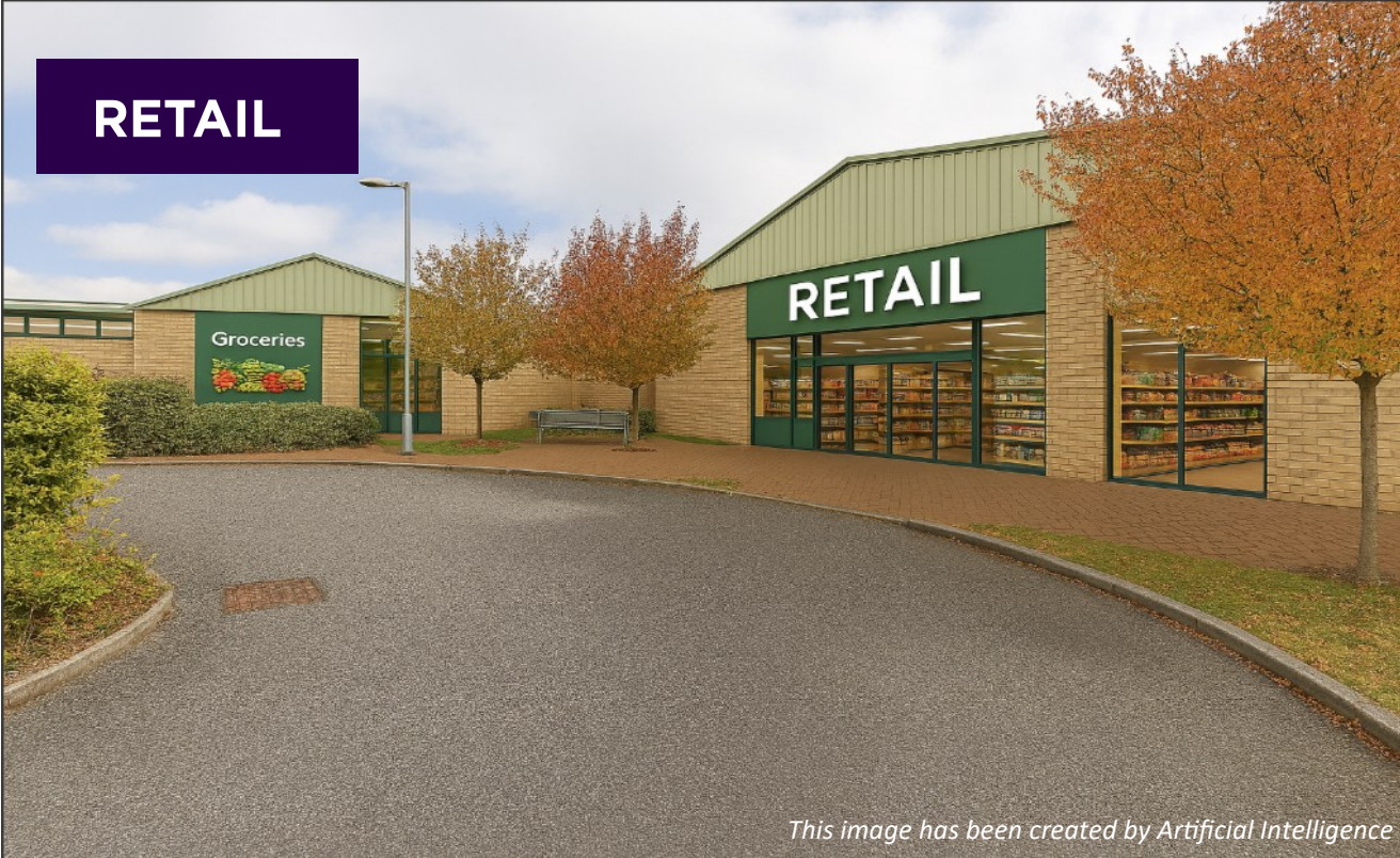
This image has been created by Artificial Intelligence