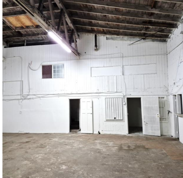
6080 & 6084 South Hoover Street, Los Angeles, CA 90044