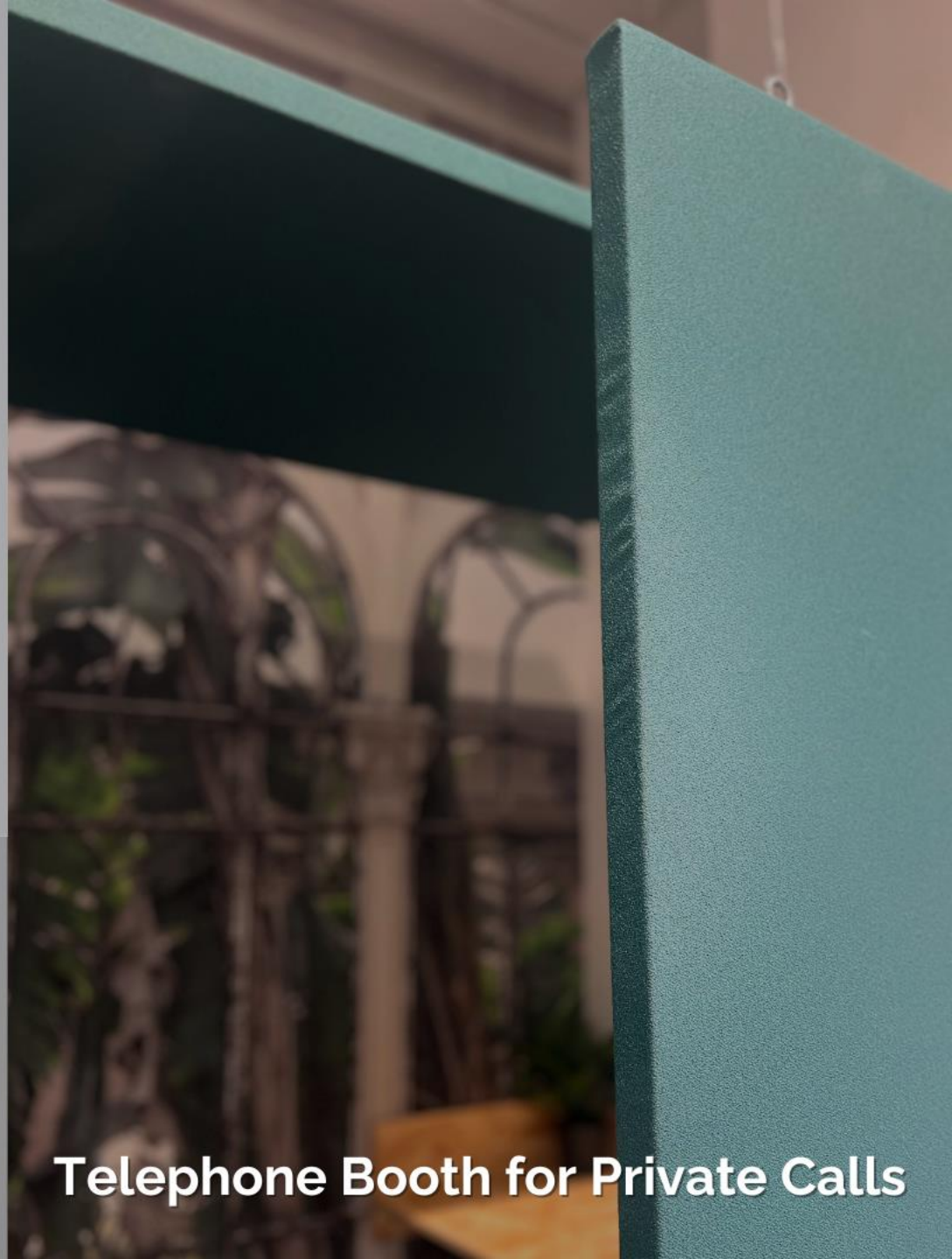
Telephone Booth for Private Calls