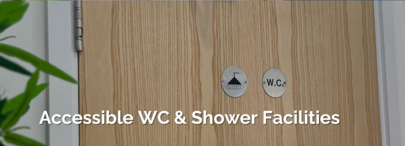
Accessible WC & Shower Facilities