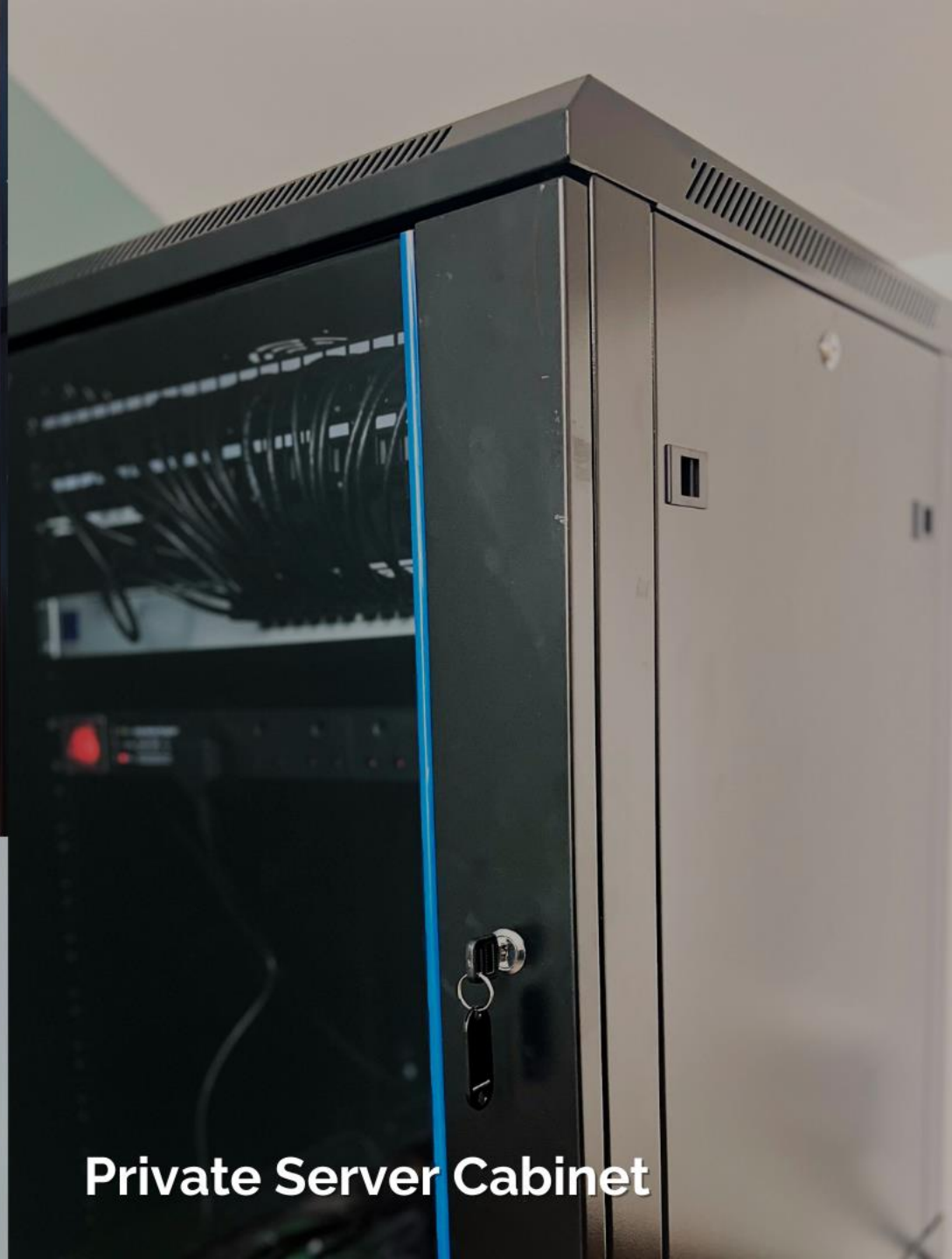
Private Server Cabinet