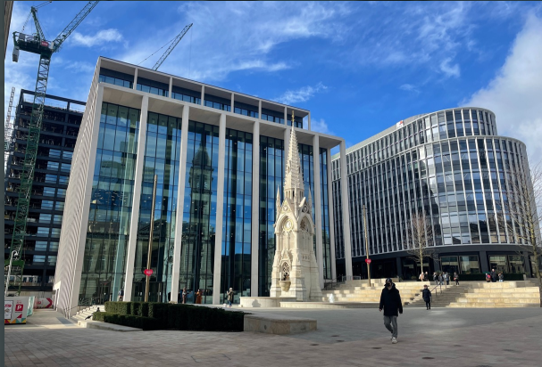
The Old Post Office Victoria Street Derby. DE1 1EQ