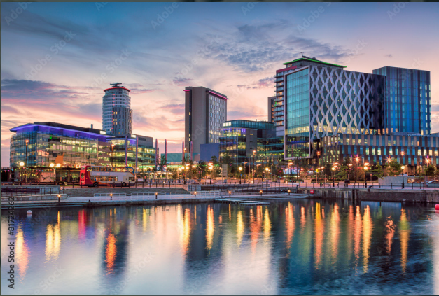
40 Princes Street Edinburgh EH2 2BY