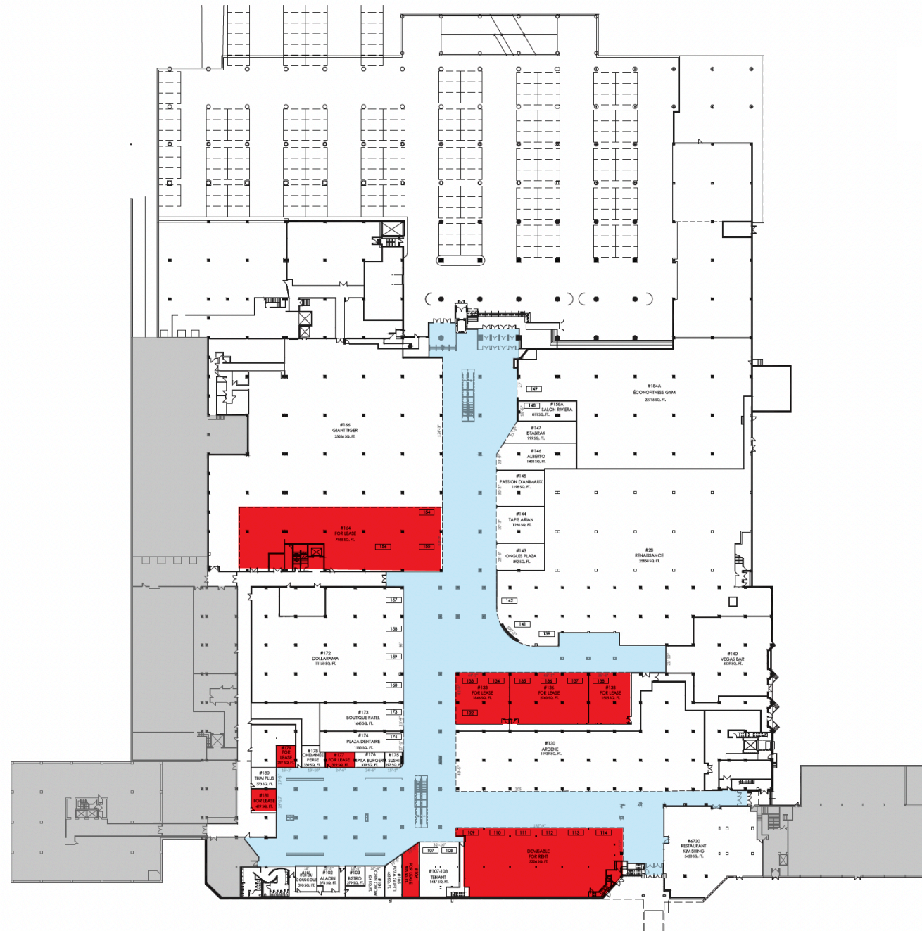
Chemin de la Côte-des-Neiges