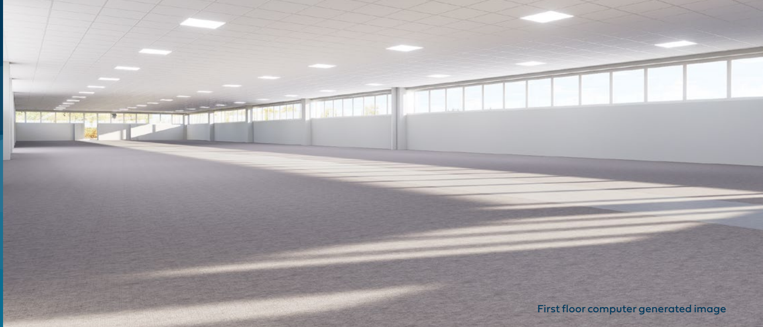
First floor computer generated image

The building benefits from a wide range of on-site amenities including a café and fitness studio and offers excellent connectivity, being only a 5-minute drive from Junction 12 M4 motorway and Theale train station.