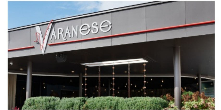
📍 Varanese Restaurant