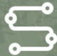
Reliable Public Transport