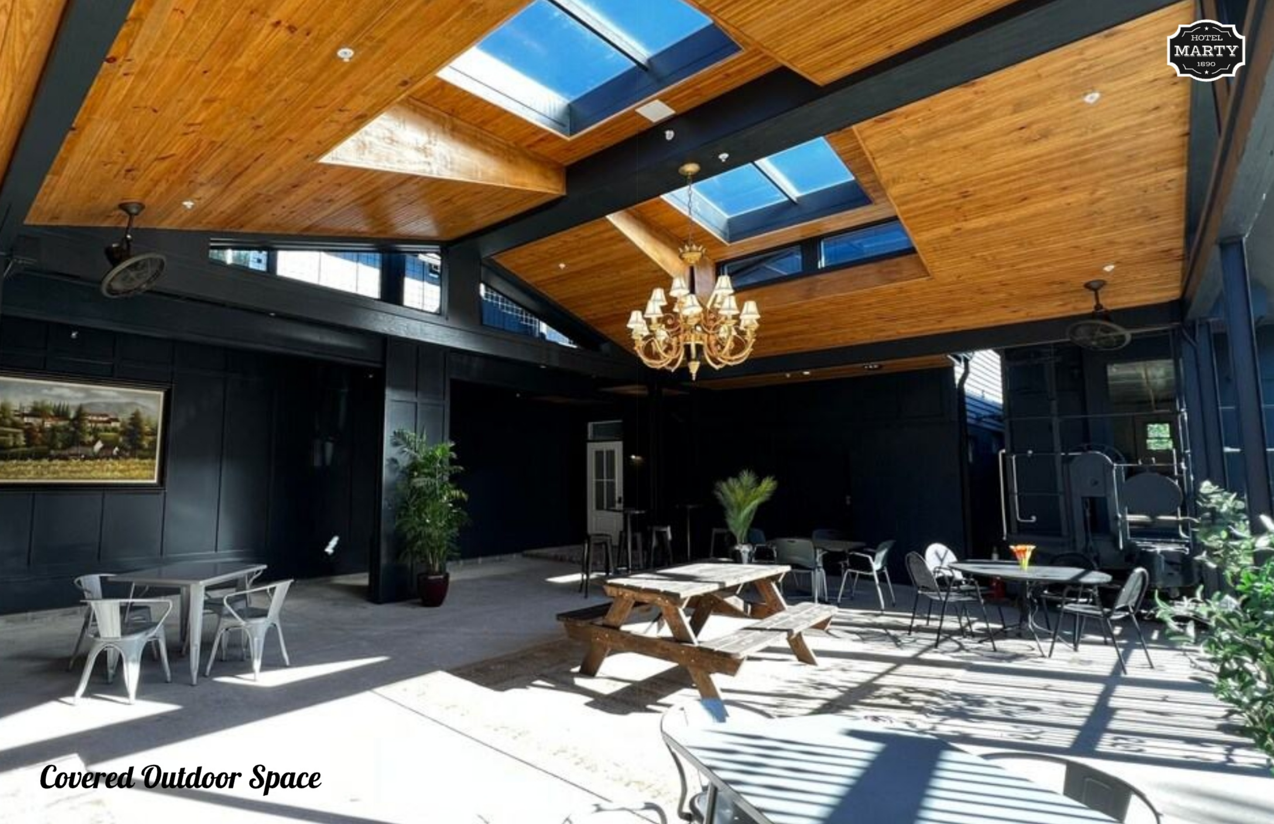
Covered Outdoor Space