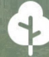
Beautiful Public Parks