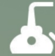
Legendary bourbon distilleries