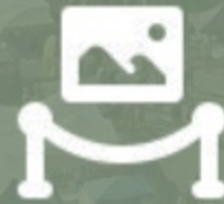
Renowned Museums and Zoos