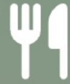
Top 10 Culinary Scene in the U.S.

From the world-renowned excitement of the Kentucky Derby at Churchill Downs to the immersive journey through the bourbon distilleries along the Urban Bourbon Trail, Louisville offers an unforgettable experience for every traveler. Indulge your senses in the city's dynamic culinary scene, explore its captivating museums and historic landmarks, and immerse yourself in the warm embrace of Southern charm. Whether you're strolling along the scenic riverfront, admiring the stunning architecture of Old Louisville, or enjoying the festive atmosphere of its lively neighborhoods, Louisville promises an authentic and memorable adventure that will leave you enchanted and eager to return.