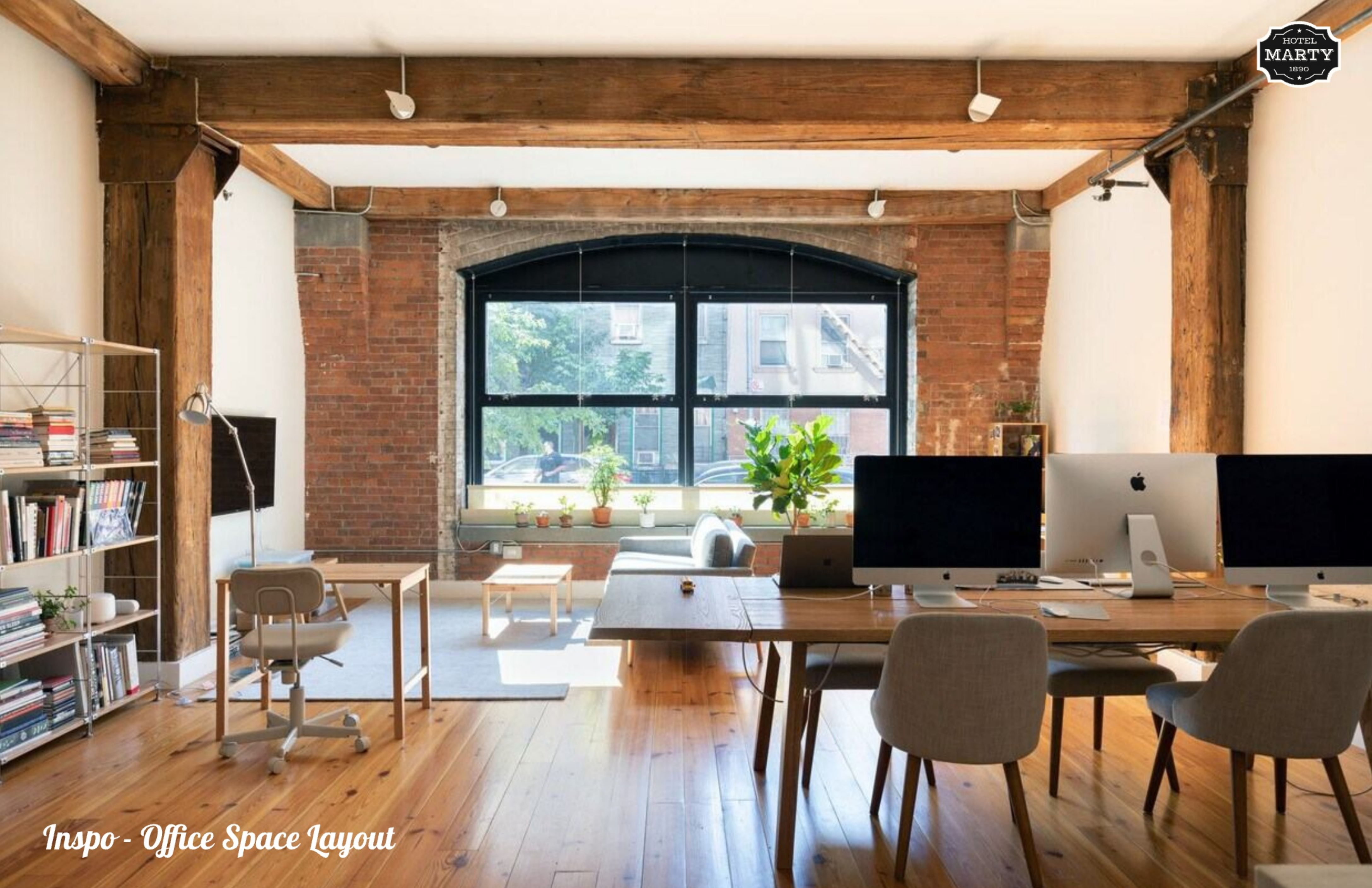
Inspo - Office Space Layout