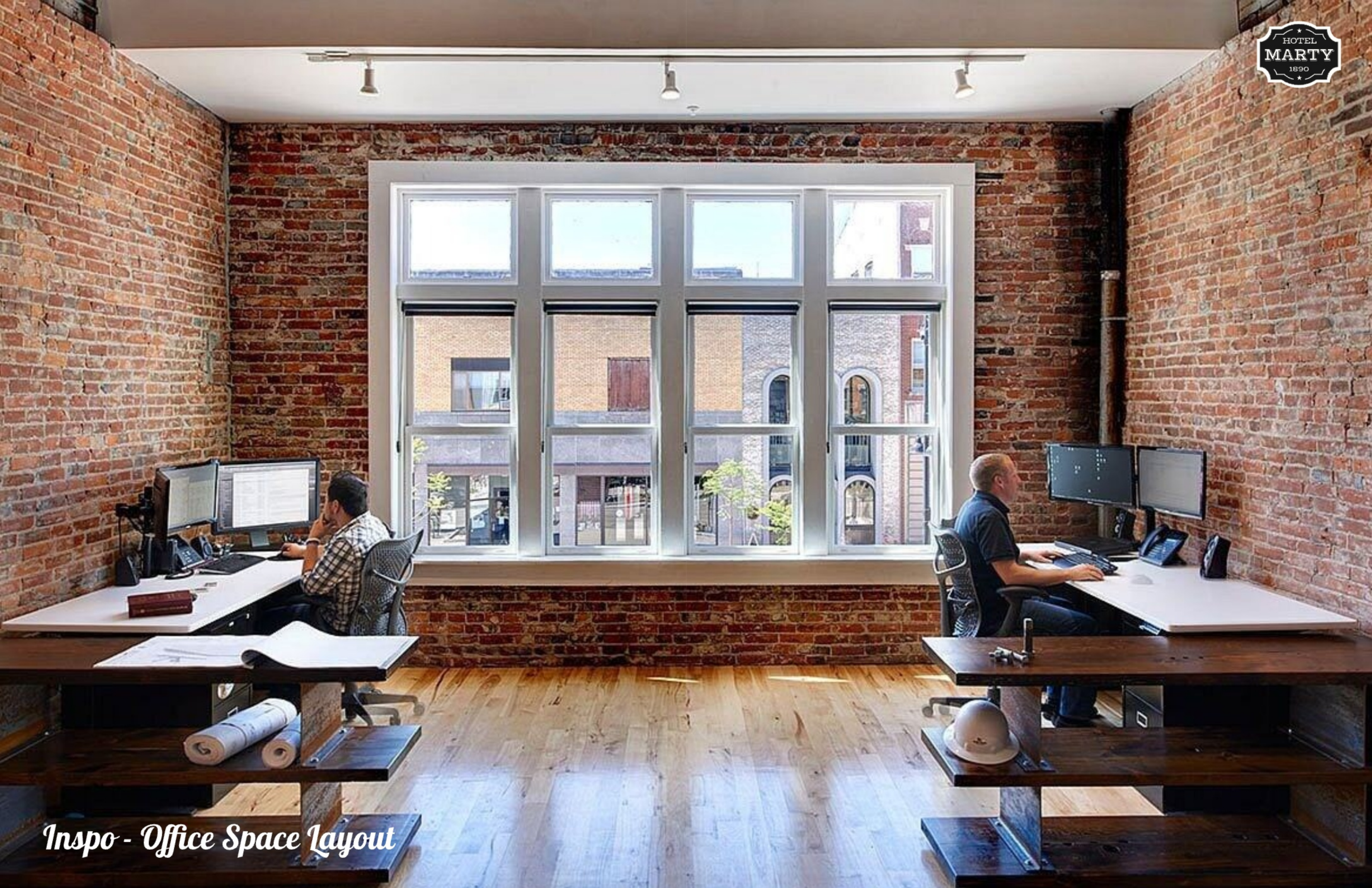
Inspo - Office Space Layout