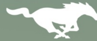
World-Class Horse Racing