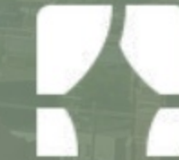
Immersive Theaters and Performances