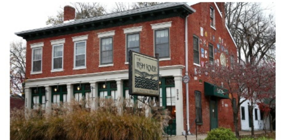
📍 Irish Rover