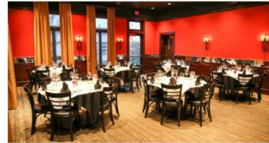
📍 Volare Italian Ristorante