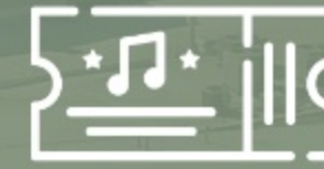
Euphoric Music Festivals