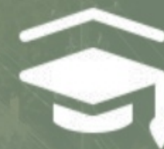
Highly Educated Population