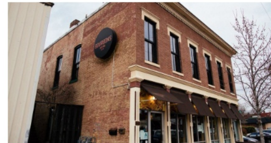
📍 Bourbons Bistro