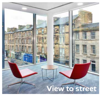
View to street