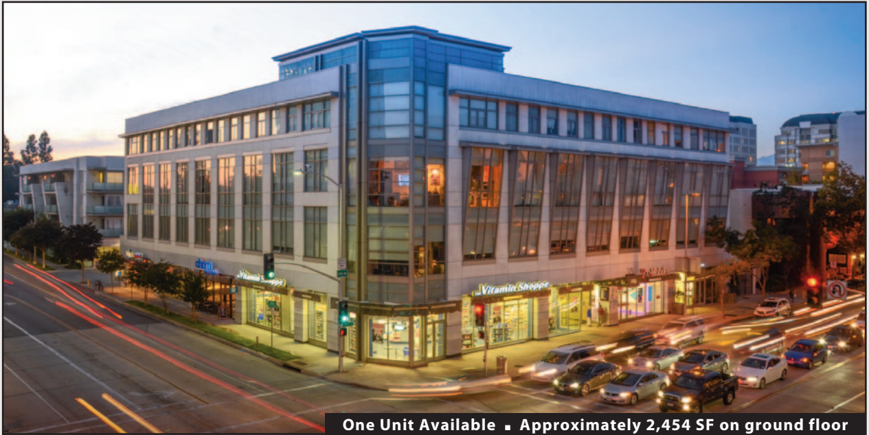
One Unit Available ■ Approximately 2,454 SF on ground floor