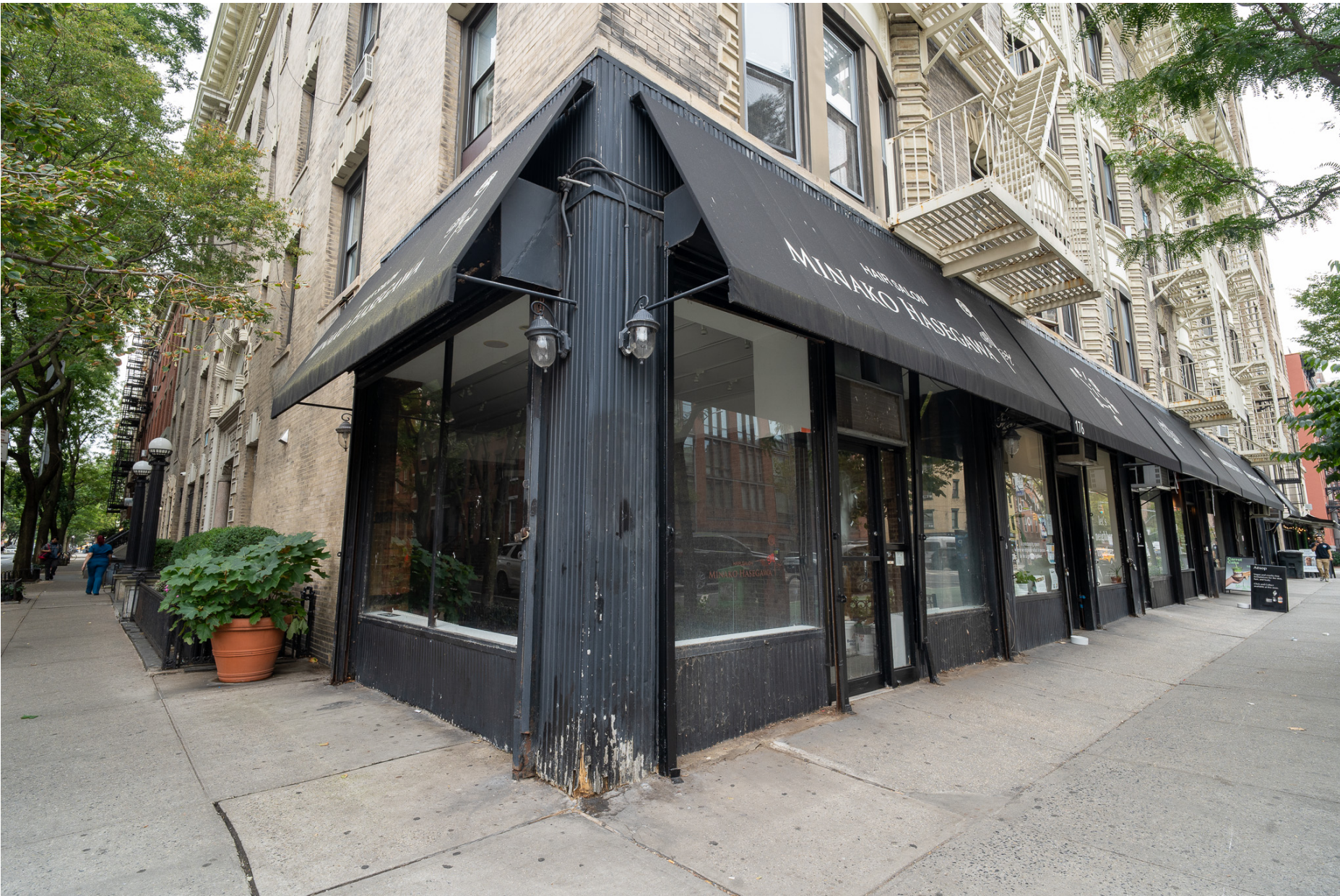
178 9th Avenue Prime Corner Retail For lease