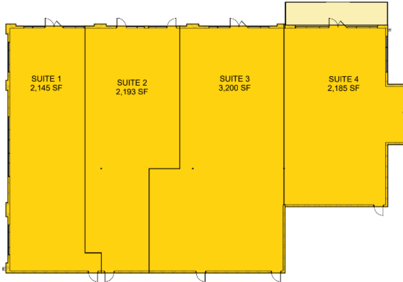
SUITES LAYOUT 1" = 20'-0"