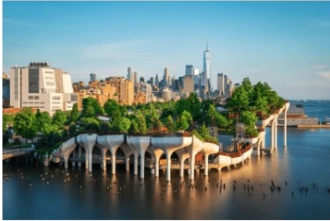
Hudson River Park / Little Island

NEIGHBORHOOD HIGHLIGHTS ATTRACTING MILLIONS OF LOCALS AND TOURISTS