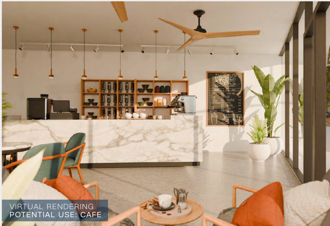
VIRTUAL RENDERING POTENTIAL USE: CAFE