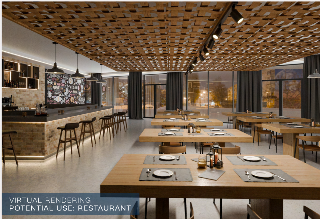
VIRTUAL RENDERING POTENTIAL USE: RESTAURANT