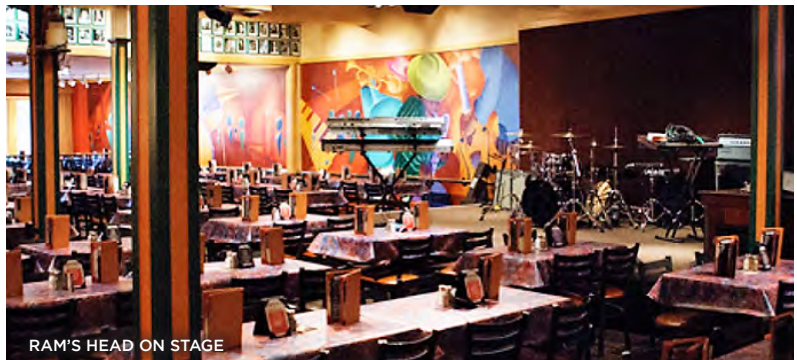
RAM'S HEAD ON STAGE

RAMS HEAD OnStage The top music club under 500 seats in the world! This beautiful smoke-free, seated nightclub offers an amazing array of national talent. Food and beverage served before and during show.