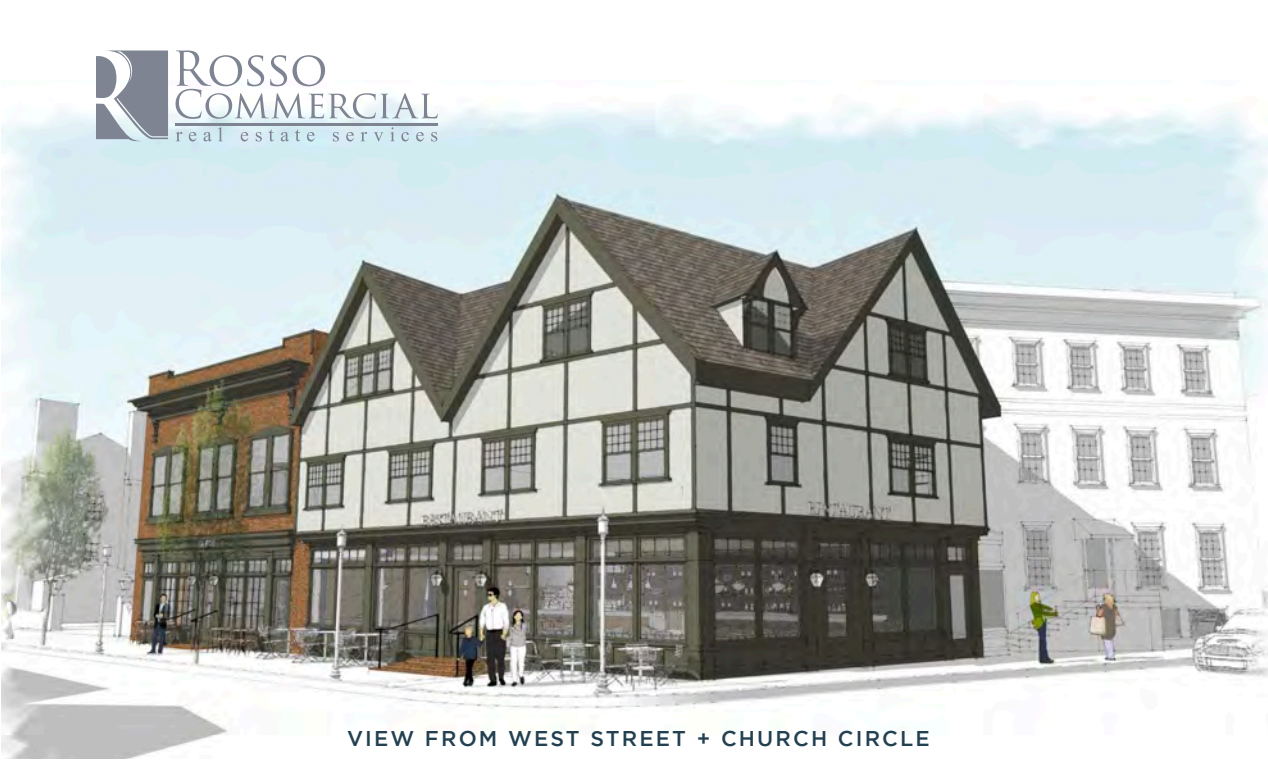
VIEW FROM WEST STREET + CHURCH CIRCLE