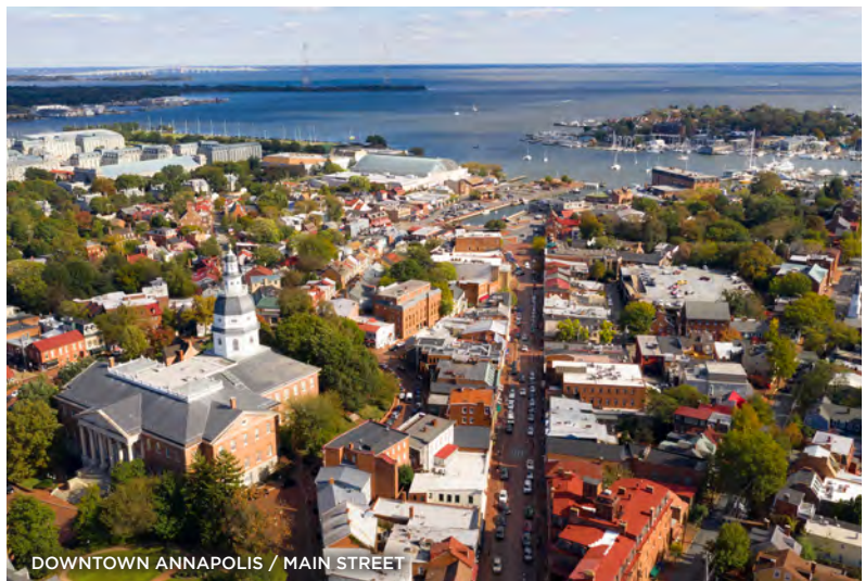
DOWNTOWN ANNAPOLIS / MAIN STREET