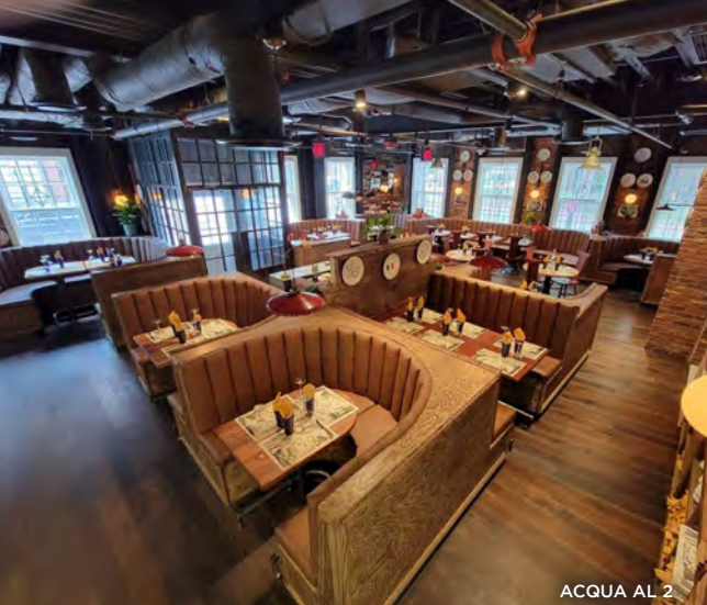
ACQUA AL 2