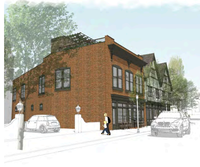
VIEW FROM WEST STREET