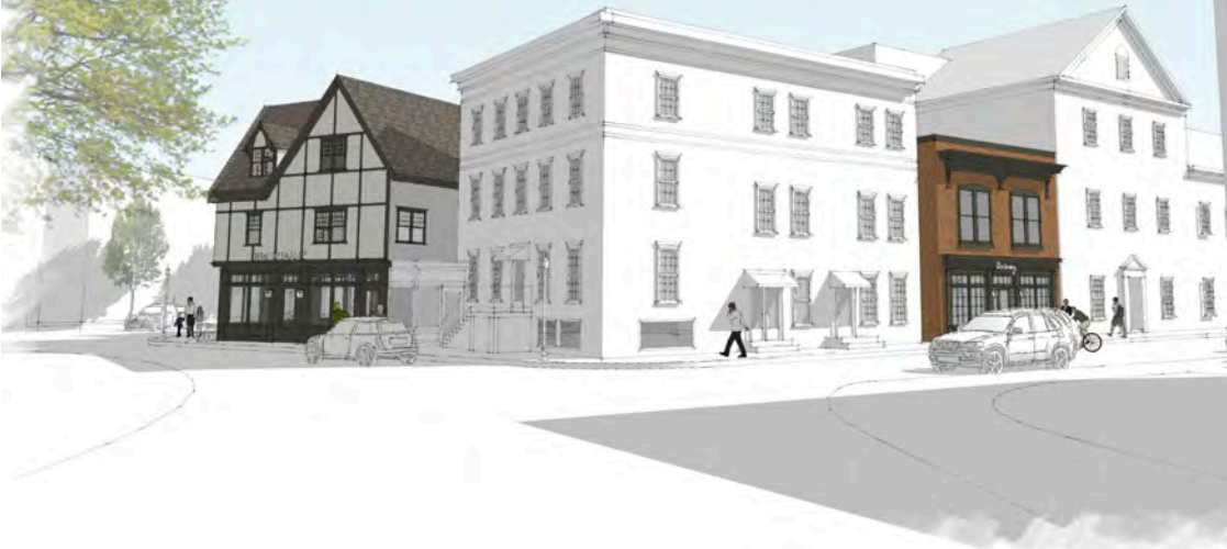
VIEW FROM CHURCH CIRCLE + NORTHWEST STREET