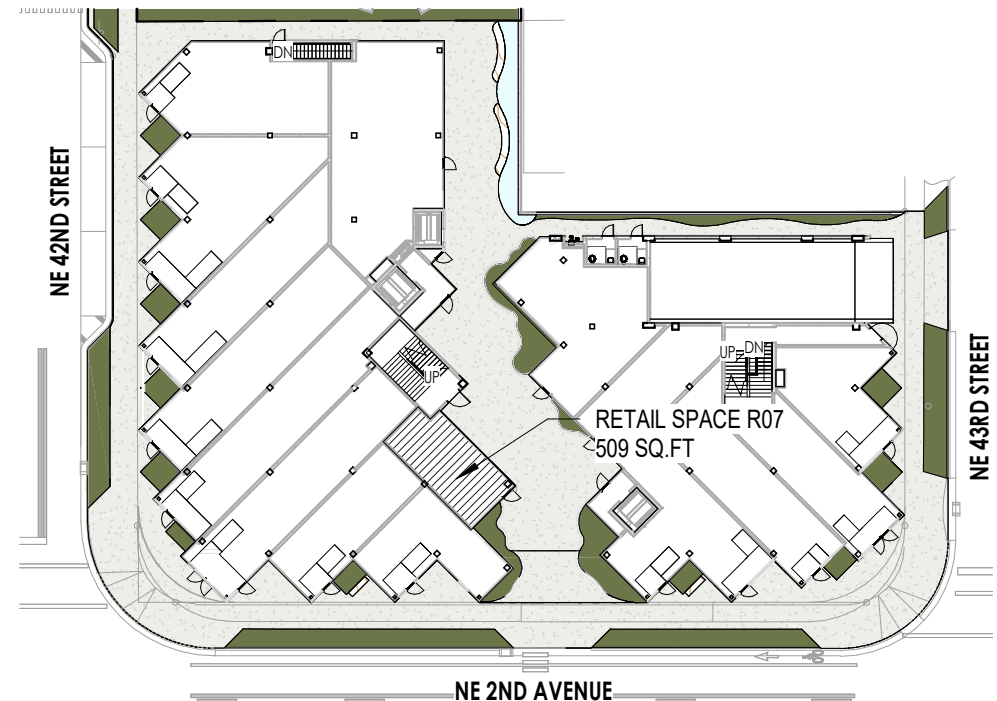
1 KEY PLAN SCALE: 1" = 50'-0"