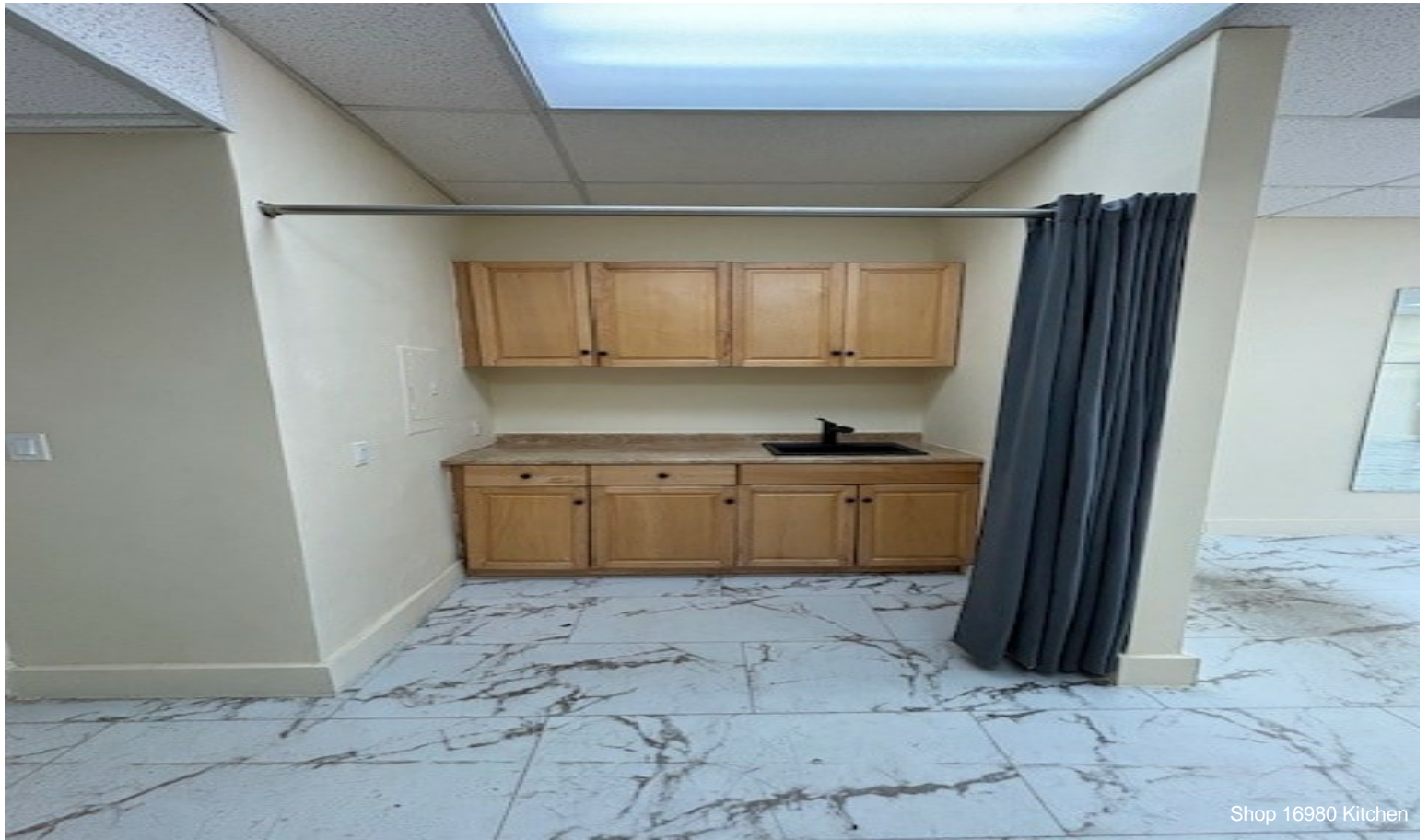
Shop 16980 Kitchen