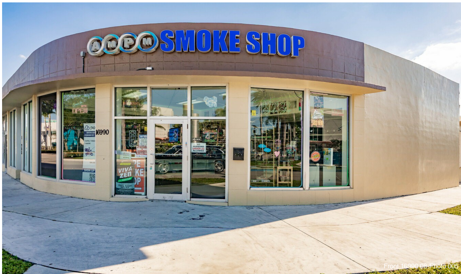
Front 16990 08-Photo 005