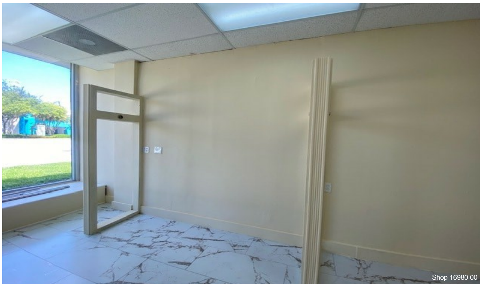
Shop 16980 00