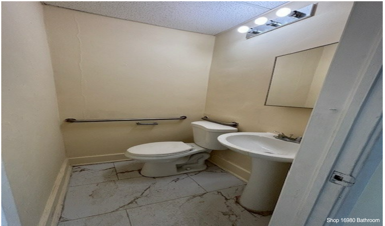
Shop 16980 Bathroom