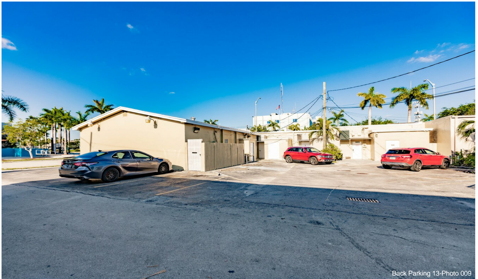
Back Parking 13-Photo 009