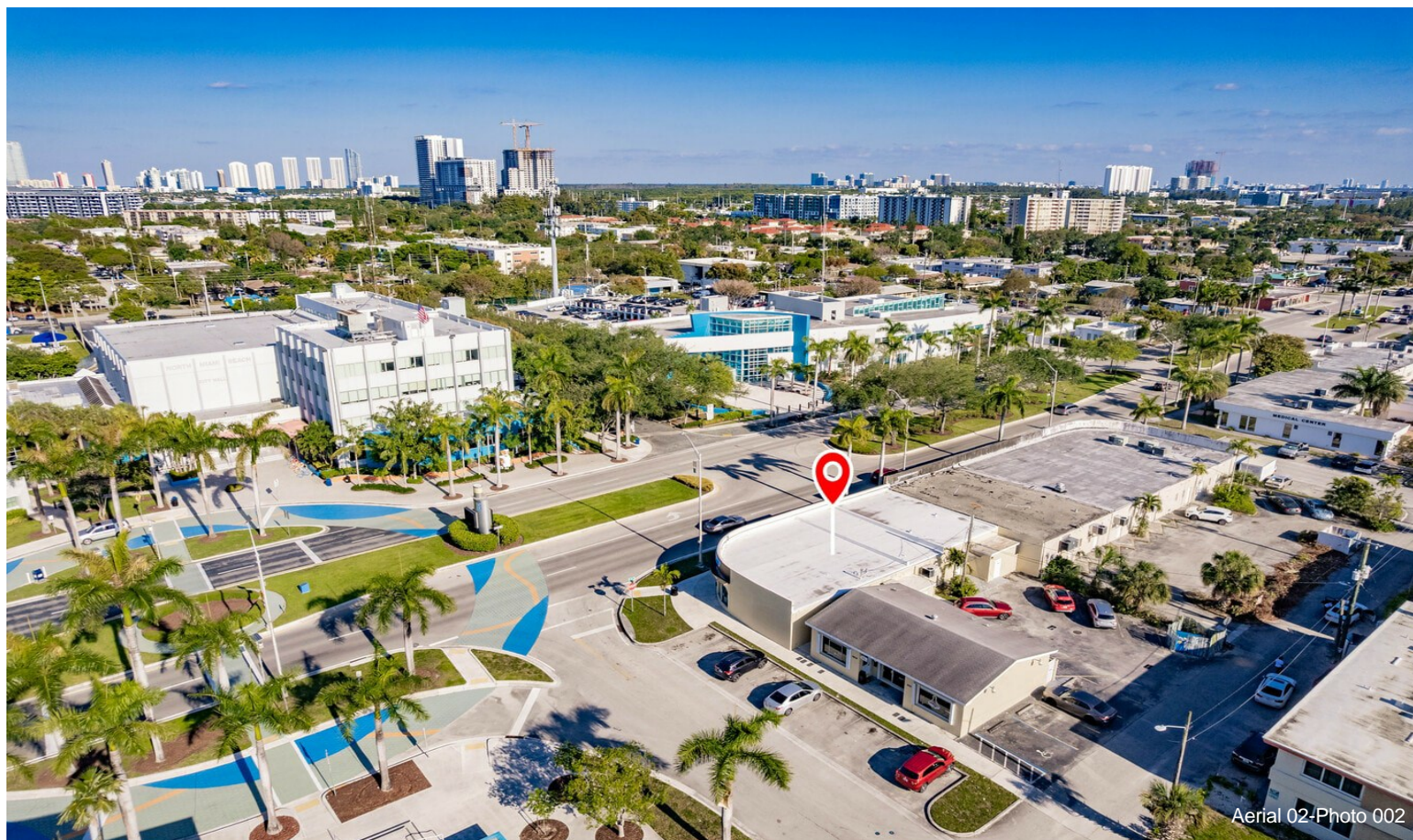
Aerial 02-Photo 002