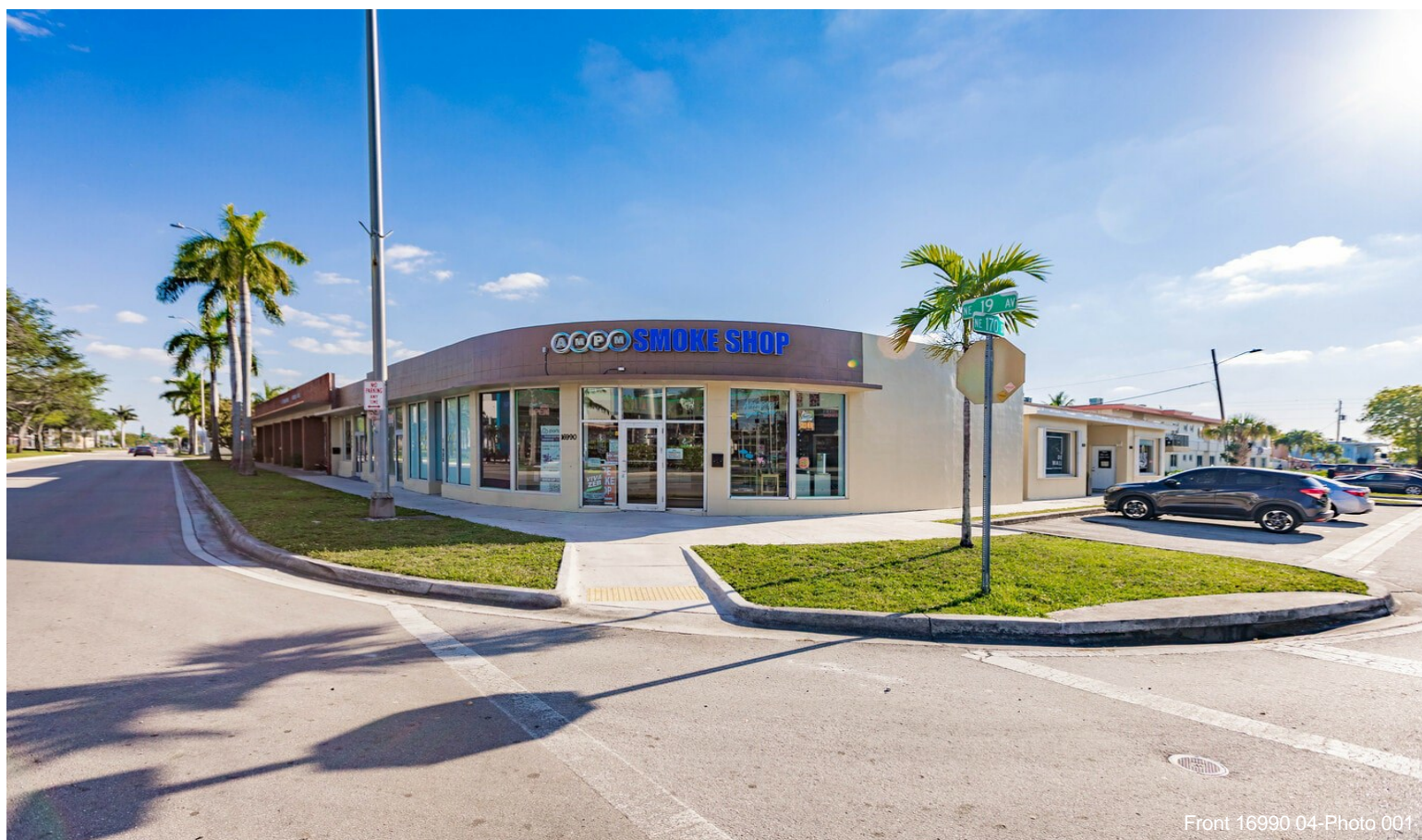
Front 16990 04-Photo 001