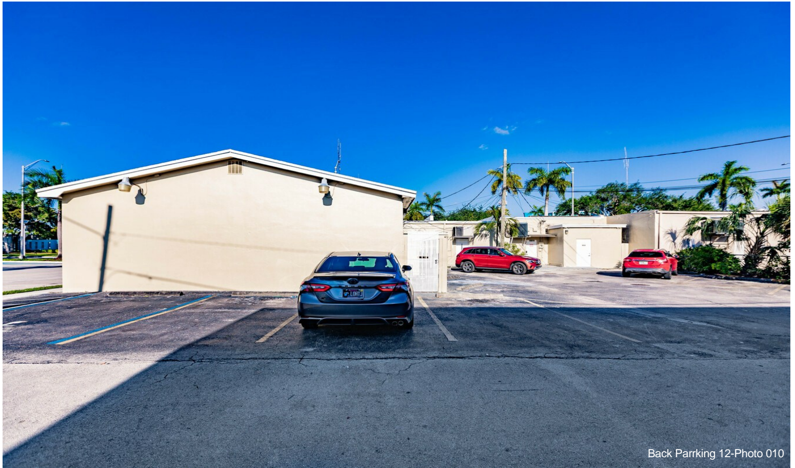
Back Parking 12-Photo 010