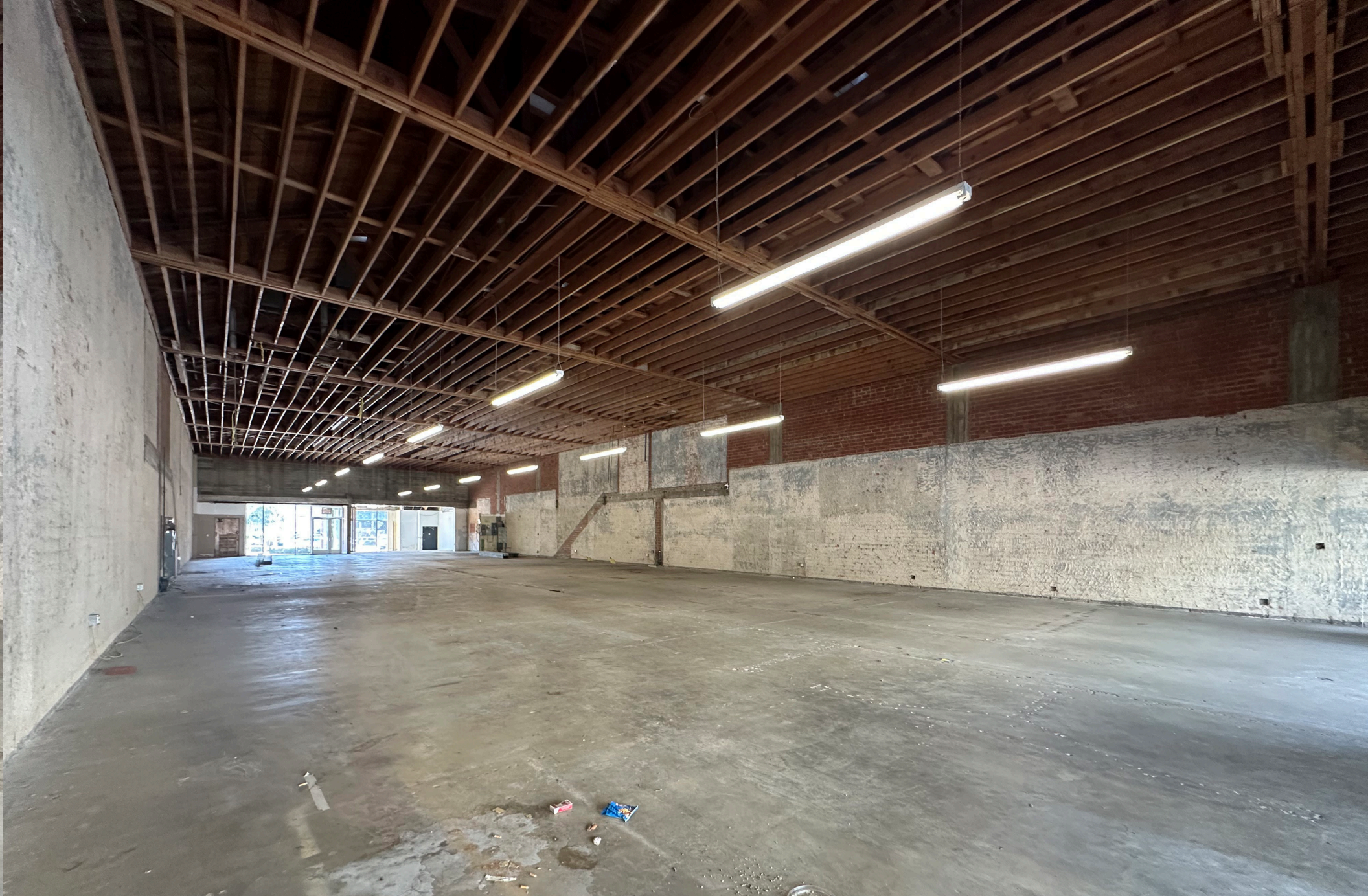
Beautifully Exposed Bow Truss with Sandblasted Brick Wall Prime Lake Avenue at Intersection/Crosswalk