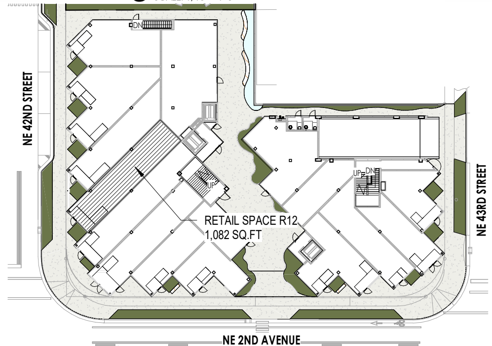
1 KEY PLAN SCALE: 1" = 50'-0"