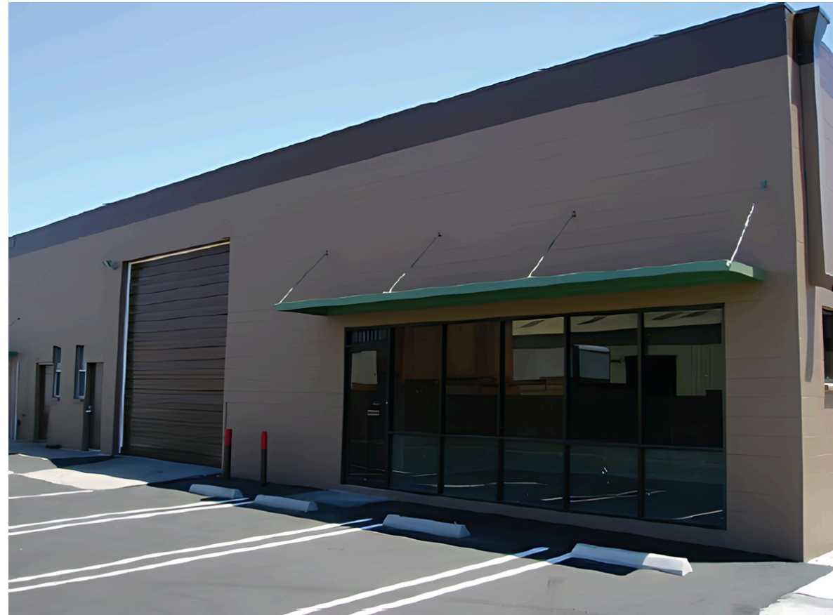
514 S. Western Ave., Unit A-D, Santa Maria, CA 93458