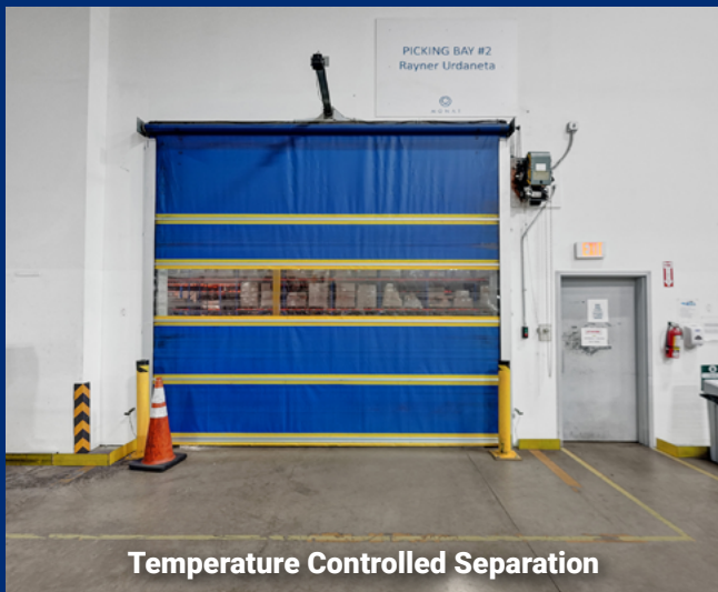
Temperature Controlled Separation