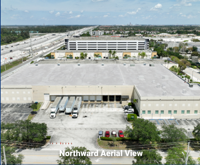
Northward Aerial View