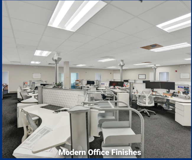
Modern Office Finishes