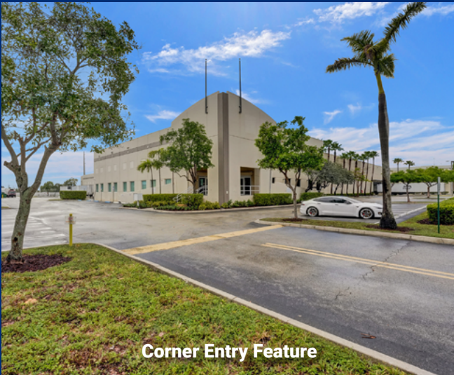
Corner Entry Feature