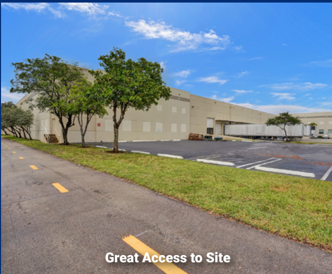
Great Access to Site