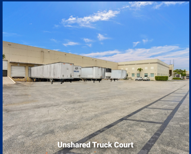
Unshared Truck Court