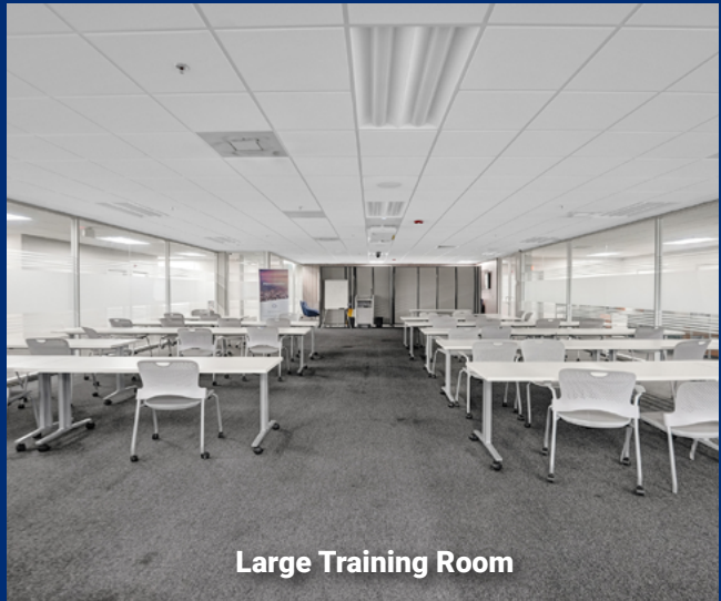
Large Training Room