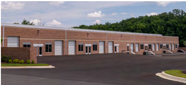
Top: Electric vehicle charging stations at 4961 Tesla Drive; Bottom: Drive-in loading with wide truck court