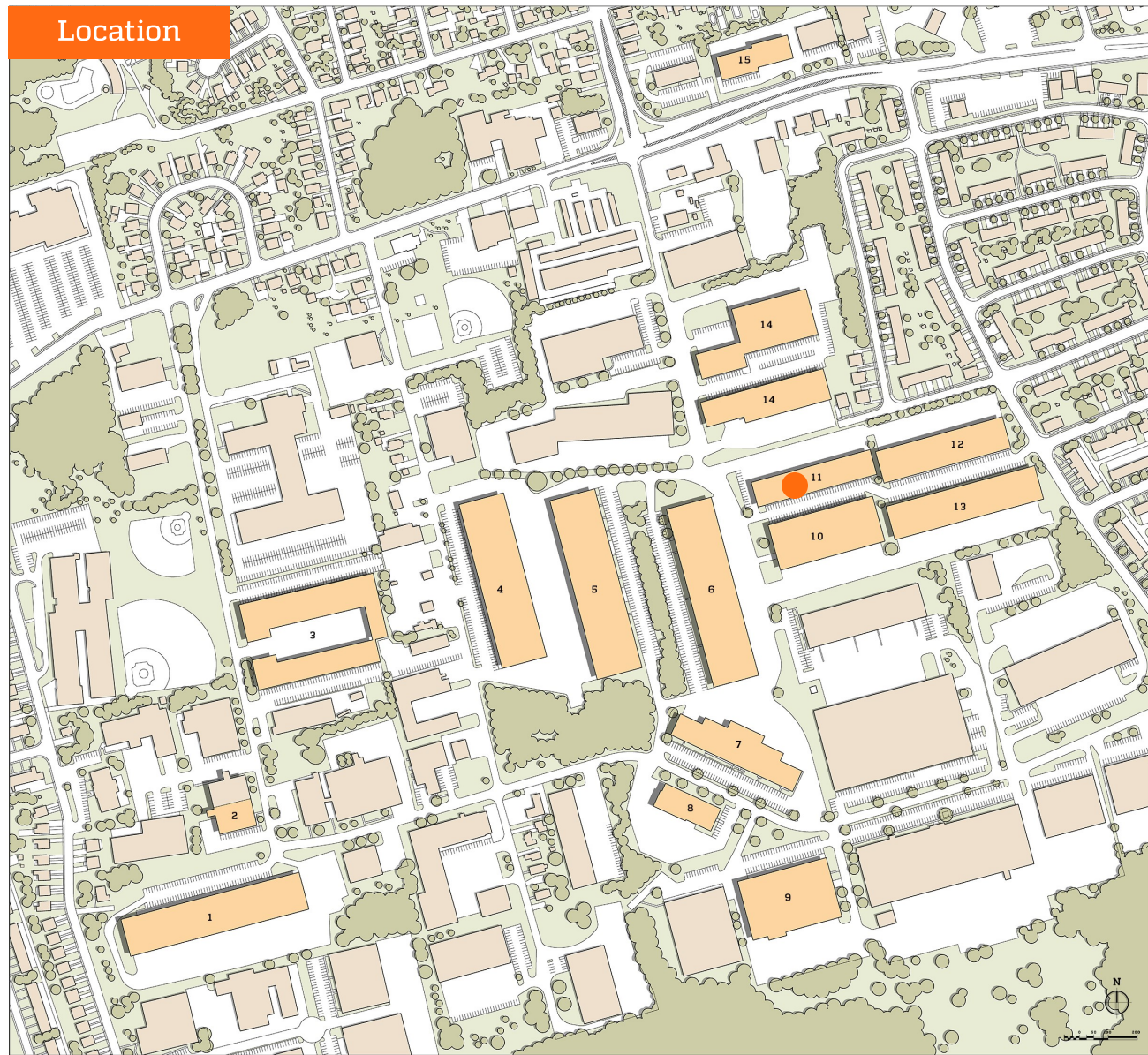
FOLCROFT WEST BUSINESS PARK