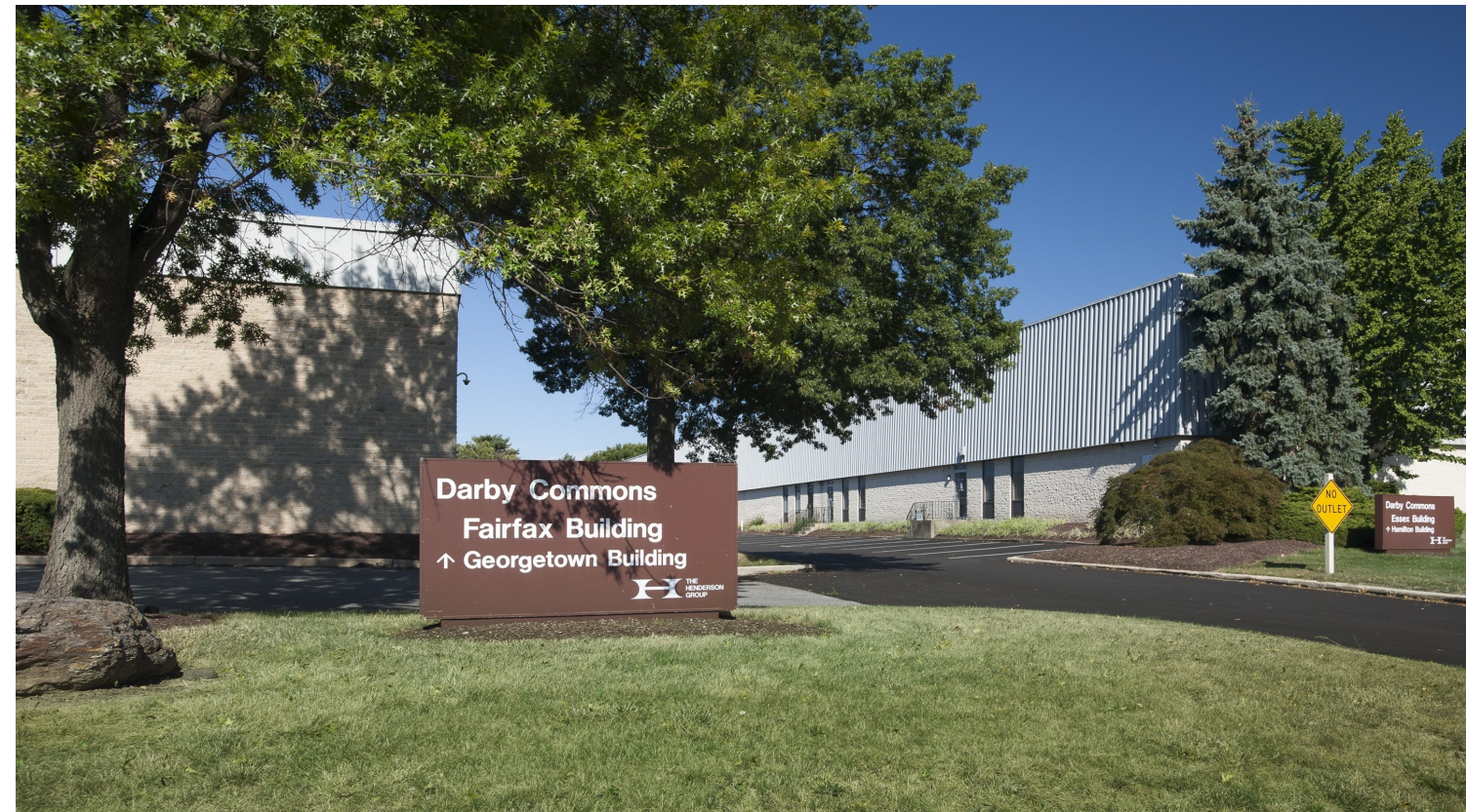
OPENING DOORS... to modern, collaborative workspaces & convenient office space