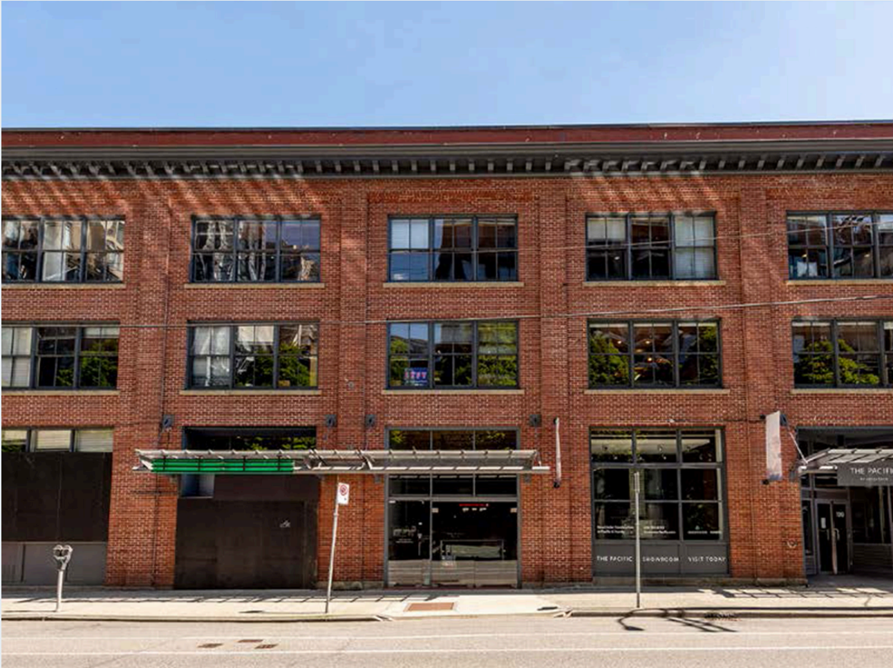
Exterior view of 1050 Homer St, facing south on Homer St

A rare opportunity to secure a character office space in the heart of Yaletown, available for 2026 occupancy.